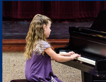
Fine Arts Recitals