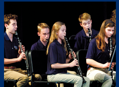
Spring Band Concert