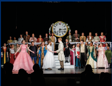
Jr. High Spring Musical Cinderella