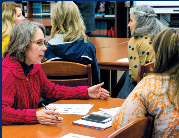
Parents at Continuing the Discussion...