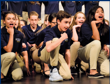
Spring Pops Concert