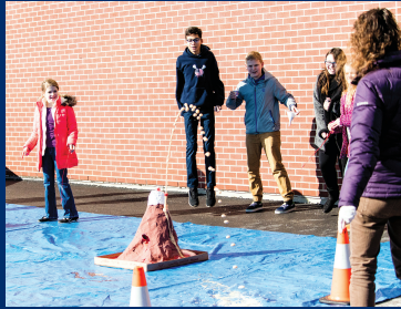
6 th graders erupting volcanoes in science