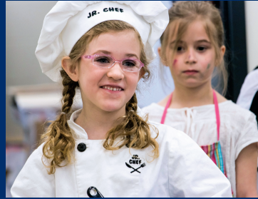
Career Day in 1 st grade