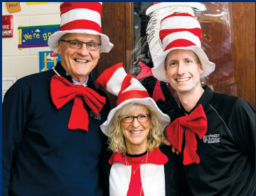
Dr. Seuss Day with many Cats in the Hat!