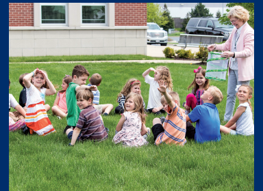
1 st grade releasing butterflies