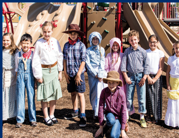
3 rd grade Pioneer Day