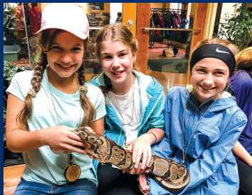
5 th graders at Outdoor Ed