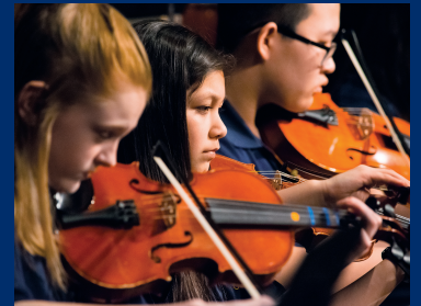
Spring Orchestra Concert