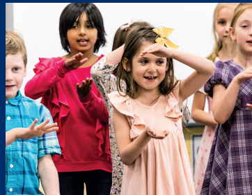
Kindergarten Mother's Day Tea