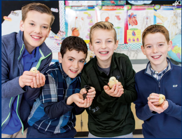
5 th graders with their newly hatched chicks